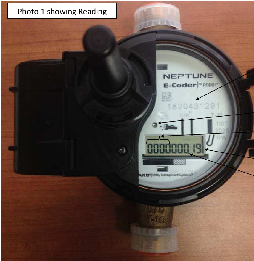
Photo 1 showing Reading